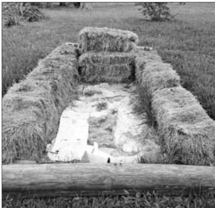
Shown before planting, a straw bale garden offers an alternative way to produce vegetables without having to stoop or bend down.

When it was time to plant, the bales were warm to the touch like the book said they should be. That's when she came to my mini-greenhouse for plants. Back home, she took a garden trowel and dug holes in the